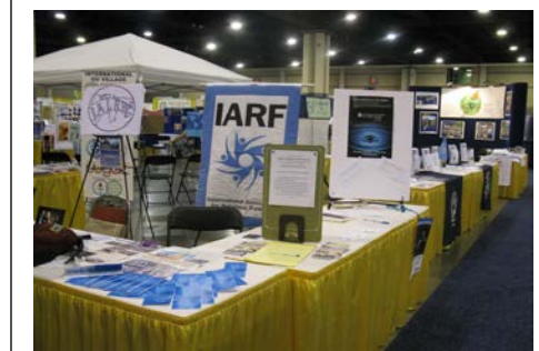
IARF booth at UUA GA