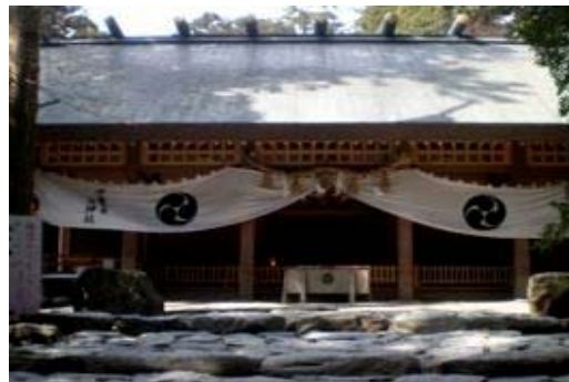
Tsubaki Grand Shrine, host to 2009 IARF Council