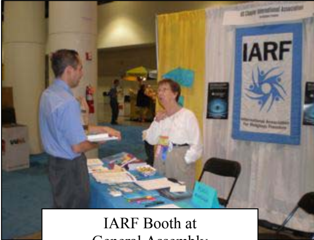
IARF Booth at General Assembly