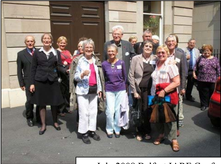
July 2008 Belfast IARF Conference